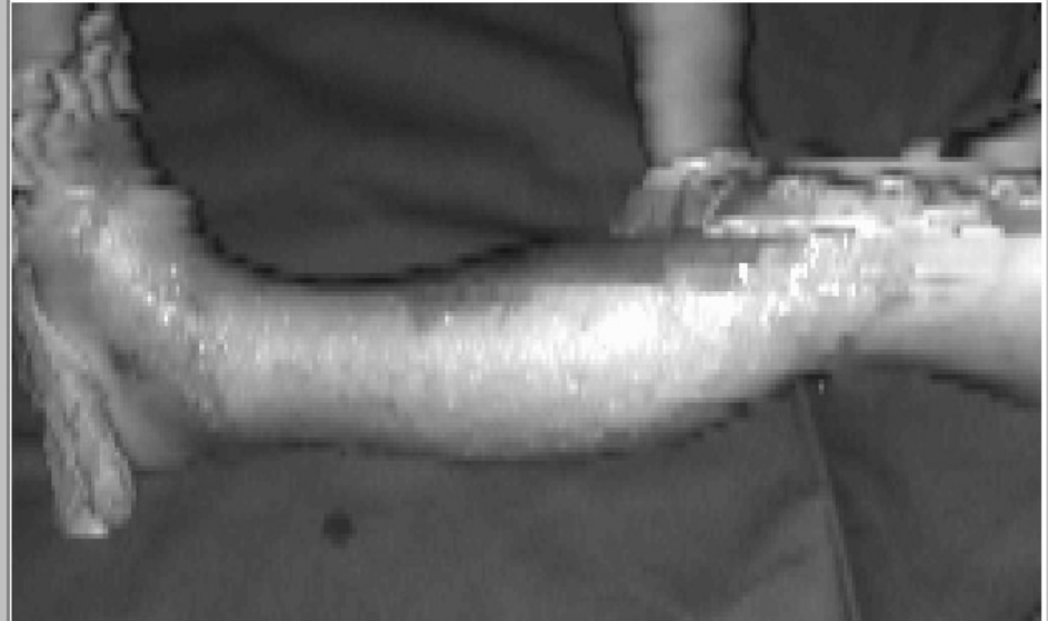
LD Photo Image